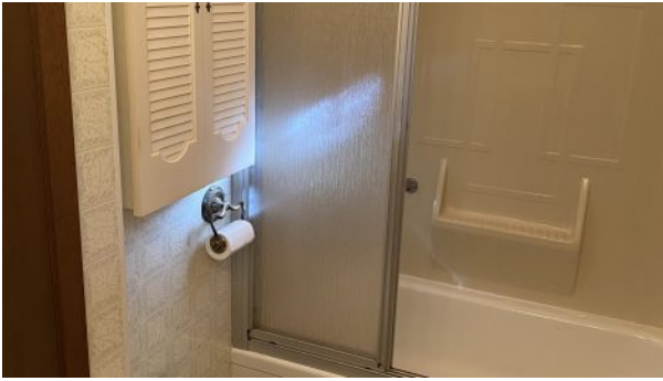
West Hawk Lake - Lakefront Cottage for Sale - 4 Piece Bath Room