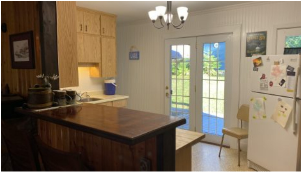
West Hawk Lake - McKenzie Beach Back Lot Cottage for Sale - Kitchen