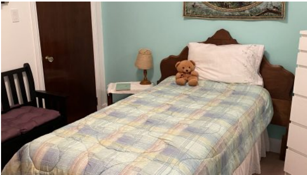
West Hawk Lake - McKenzie Beach Back Lot Cottage for Sale - 3rd Bedroom