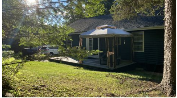
West Hawk Lake - McKenzie Beach Back Lot Cottage for Sale - Rear View