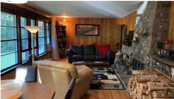
West Hawk Lake - McKenzie Beach Back Lot Cottage for Sale - Living Room