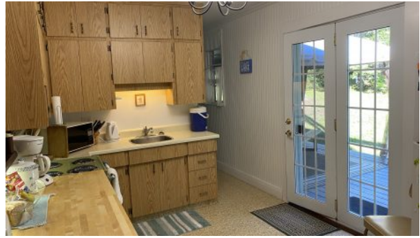
West Hawk Lake - McKenzie Beach Back Lot Cottage for Sale - Kitchen