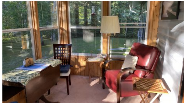
West Hawk Lake - McKenzie Beach Back Lot Cottage for Sale - Glazed Porch