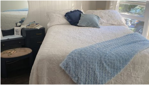
West Hawk Lake - McKenzie Beach Back Lot Cottage for Sale - Master Bedroom