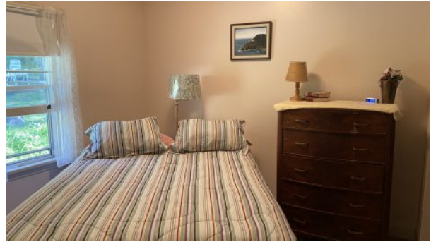
West Hawk Lake - McKenzie Beach Back Lot Cottage for Sale - 2nd Bedroom