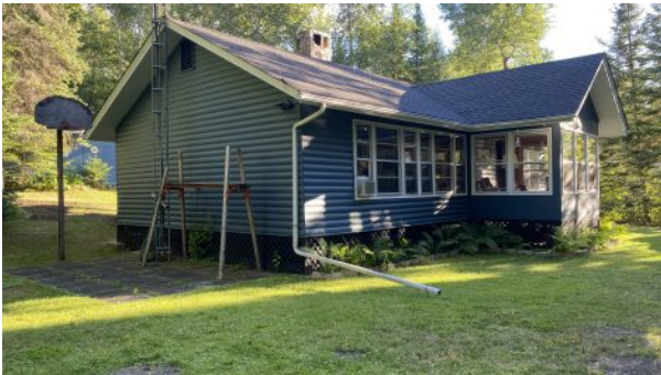
West Hawk Lake - McKenzie Beach Back Lot Cottage for Sale - East Side View