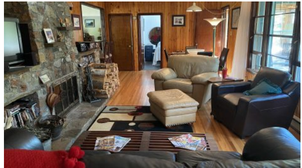
West Hawk Lake - McKenzie Beach Back Lot Cottage for Sale - Living Room