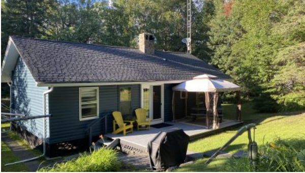
West Hawk Lake - McKenzie Beach Back Lot Cottage for Sale - Rear View