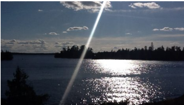
Lakefront West Hawk Lake Cottage for Sale - View of West Hawk Lake Form Cottage