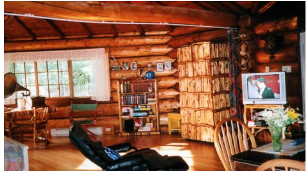
Lakefront West Hawk Lake Cottage for Sale - Open Floor Plan