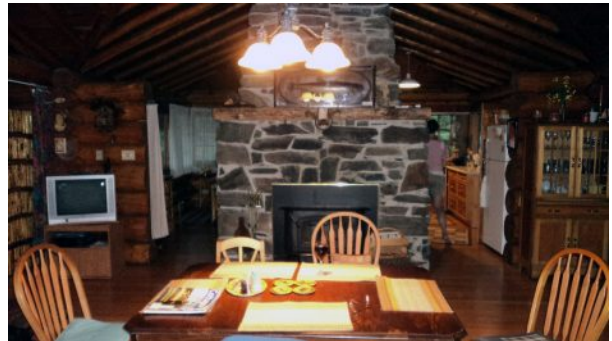
Lakefront West Hawk Lake Cottage for Sale - Dining Area with Vaulted Ceiling