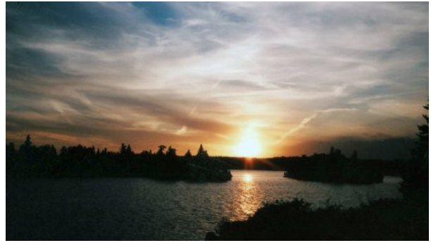
Lakefront West Hawk Lake Cottage for Sale - Enjoy the Sunset's