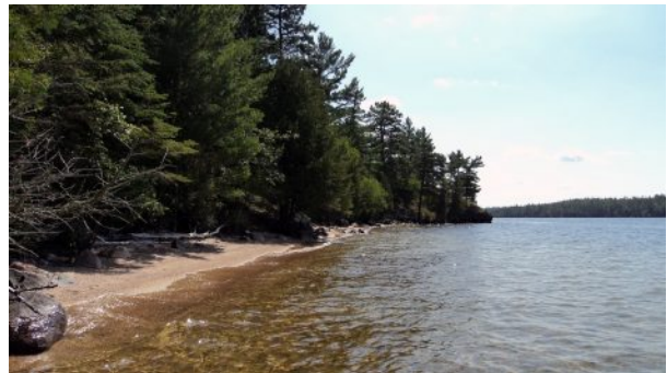
Lakefront West Hawk Lake Cottage for Sale - Sandy Beach