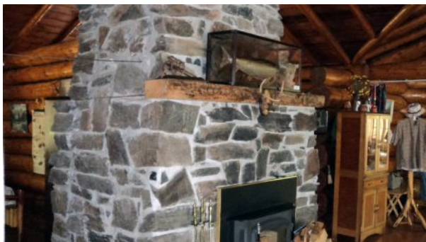
Lakefront West Hawk Lake Cottage for Sale - Stone fireplace