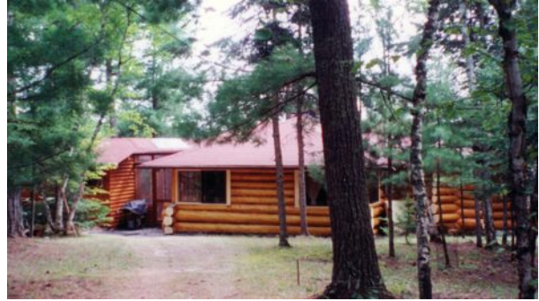
Lakefront West Hawk Lake Cottage for Sale