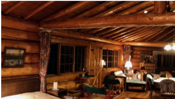
Lakefront West Hawk Lake Cottage for Sale - Open Ceiling