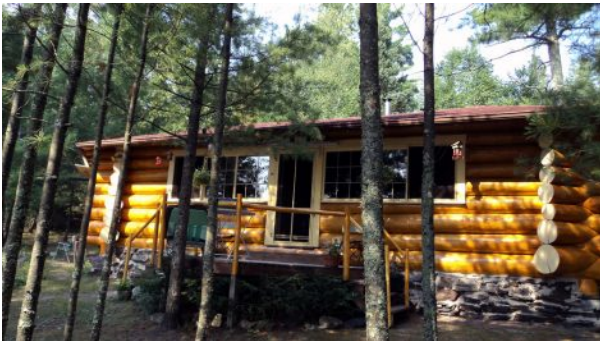
Lakefront West Hawk Lake Cottage for Sale Log Cabin Built in 1939