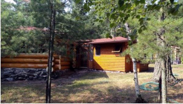
Lakefront West Hawk Lake Cottage for Sale