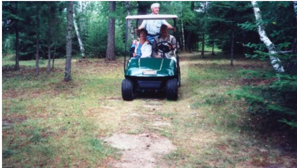
Lakefront West Hawk Lake Cottage for Sale - Guests Arrive