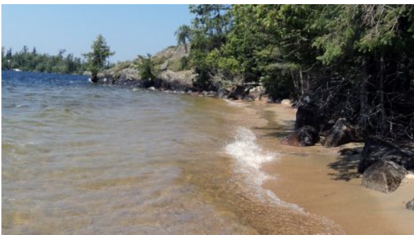
Lakefront West Hawk Lake Cottage for Sale - Sandy