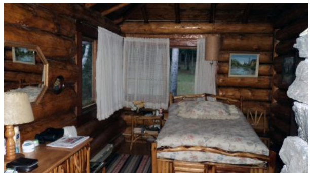
Lakefront West Hawk Lake Cottage for Sale - Queens Room