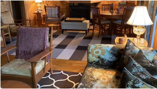
West Hawk Lake - Lakefront Cottage for Sale - Living room