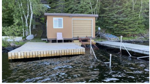
West Hawk Lake - Lakefront Cottage for Sale - Boat House