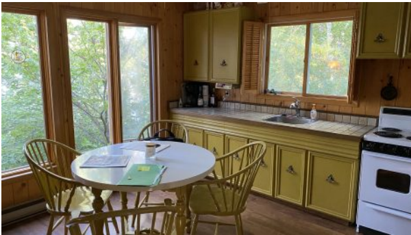
West Hawk Lake - Lakefront Cottage for Sale - Kitchen / Dining Room with View to Lake