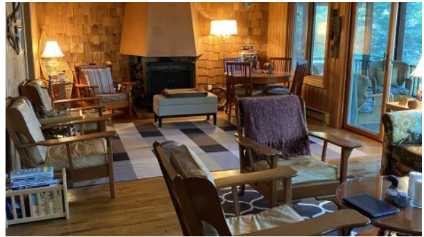
West Hawk Lake - Lakefront Cottage for Sale - Living Room with Patio Doors onto Screened Porch