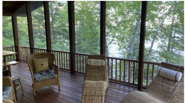
West Hawk Lake - Lakefront Cottage for Sale - Screened Porch with View to Lake