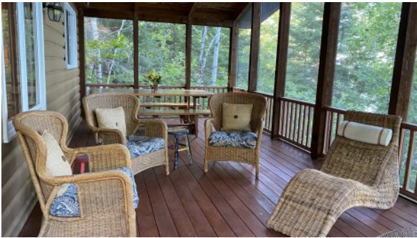
West Hawk Lake - Lakefront Cottage for Sale - Screened Porch with View to Lake