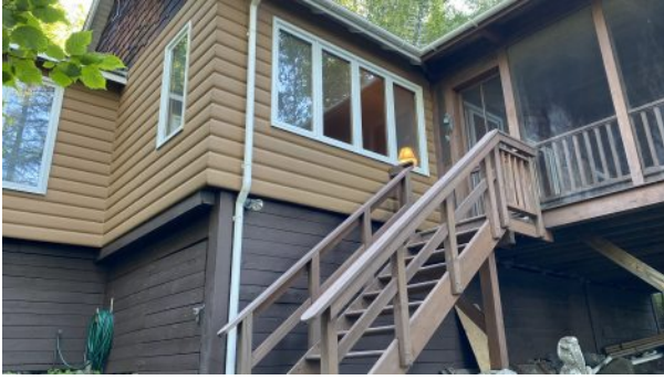
West Hawk Lake - Lakefront Cottage for Sale - Front of Cottage