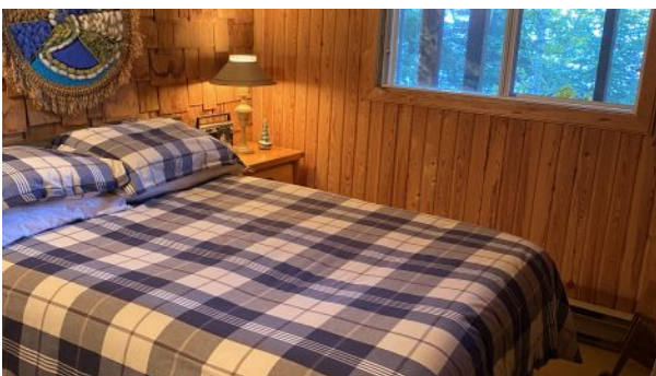
West Hawk Lake - Lakefront Cottage for Sale - Bedroom #3 - View to Lake