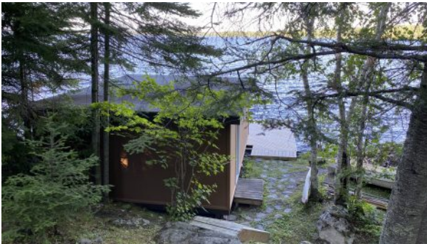
West Hawk Lake - Lakefront Cottage for Sale - Steps Down to Boat House