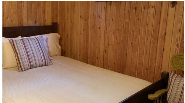
West Hawk Lake - Lakefront Cottage for Sale - Bedroom #1