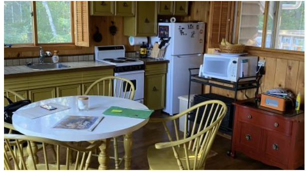
West Hawk Lake - Lakefront Cottage for Sale - Kitchen / Dining Room