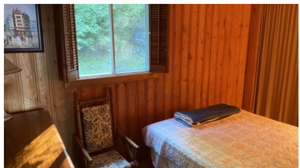
West Hawk Lake - Lakefront Cottage for Sale - Bedroom #2