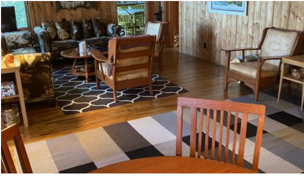
West Hawk Lake - Lakefront Cottage for Sale - Living Room connected to Kitchen / Dining room