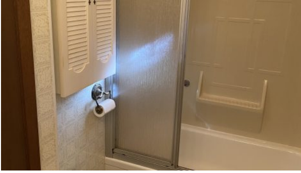
West Hawk Lake - Lakefront Cottage for Sale - 4 Piece Bath Room