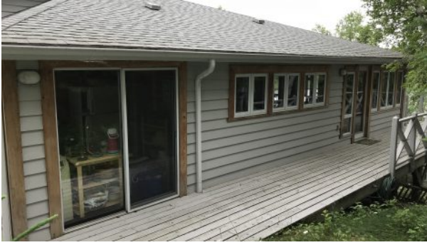
David Ellie Whiteshell Cottage Specialist - Side View West Hawk Lake Luxury