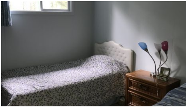
West Hawk Lake Back Lot Cottage with Docks at Waters Edge Falcon Realty Cottage for sale David Ellie Whiteshell Cottage Specialist