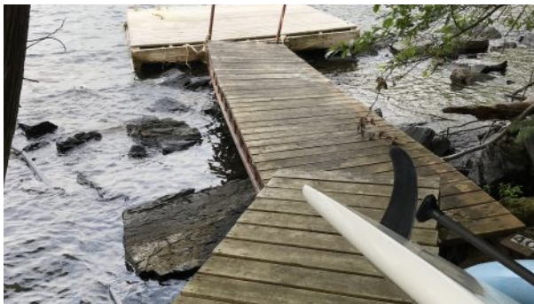
West Hawk Lake Back Lot Cottage with Docks at Waters Edge Falcon Realty Cottage for sale David Ellie Whiteshell Cottage Specialist