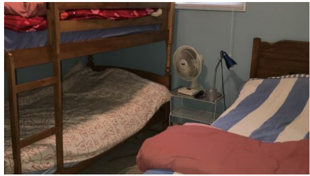
West Hawk Lake Back Lot Cottage with Docks at Waters Edge Falcon Realty Cottage for sale David Ellie Whiteshell Cottage Specialist