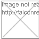
Image not readable or empty http://falconrealty.ca/wp-content/uploads/2015/04/FALCON_Logo_Green.png

Need an expert... Call us now - 204-349-3283