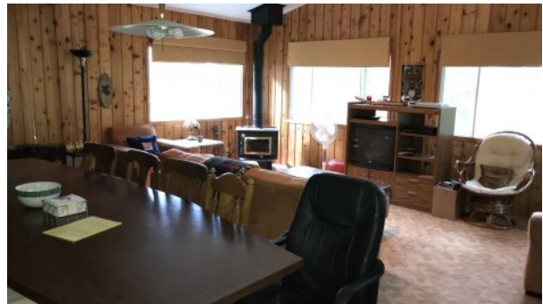
West Hawk Lake Back Lot Cottage with Docks at Waters Edge Falcon Realty Cottage for sale David Ellie Whiteshell Cottage Specialist