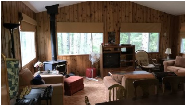
West Hawk Lake Back Lot Cottage with Docks at Waters Edge Falcon Realty Cottage for sale David Ellie Whiteshell Cottage Specialist