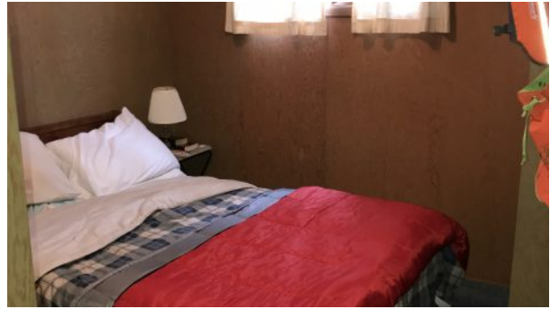
West Hawk Lake Back Lot Cottage with Docks at Waters Edge Falcon Realty Cottage for sale David Ellie Whiteshell Cottage Specialist