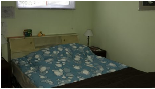
West Hawk Lake Back Lot Cottage with Docks at Waters Edge Falcon Realty Cottage for sale David Ellie Whiteshell Cottage Specialist