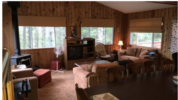
West Hawk Lake Back Lot Cottage with Docks at Waters Edge Falcon Realty Cottage for sale David Ellie Whiteshell Cottage Specialist