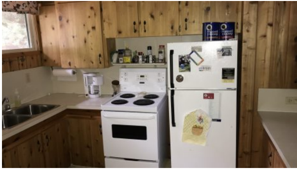
West Hawk Lake Back Lot Cottage with Docks at Waters Edge Falcon Realty Cottage for sale David Ellie Whiteshell Cottage Specialist