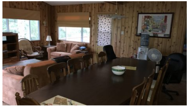
West Hawk Lake Back Lot Cottage with Docks at Waters Edge Falcon Realty Cottage for sale David Ellie Whiteshell Cottage Specialist