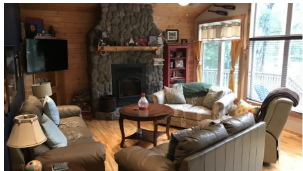
Stunning 4 Season Whiteshell Cottage for Sale Block 12 Falcon Lake - Living Room