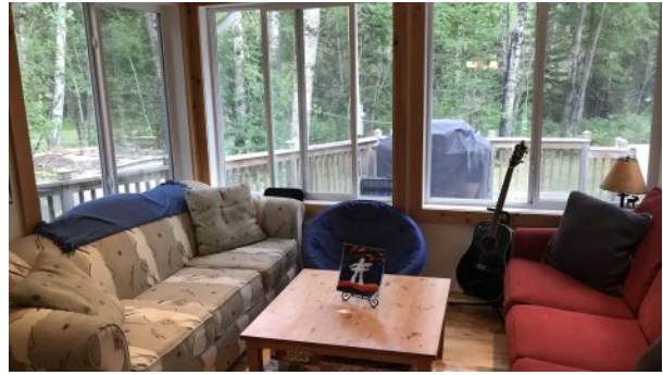
Stunning 4 Season Whiteshell Cottage for Sale Block 12 Falcon Lake - Sun Room