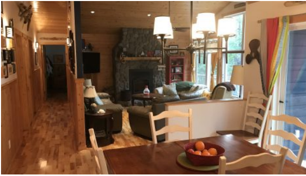
Stunning 4 Season Whiteshell Cottage for Sale Block 12 Falcon Lake - Kitchen - Living Room