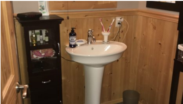
Stunning 4 Season Whiteshell Cottage for Sale Block 12 Falcon Lake - Ensuite