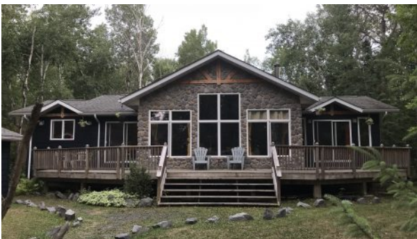
Stunning 4 Season Whiteshell Cottage for Sale Block 12 Falcon Lake - Front View