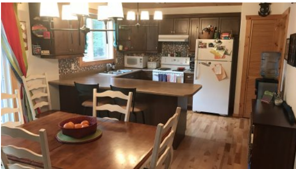
Stunning 4 Season Whiteshell Cottage for Sale Block 12 Falcon Lake - Kitchen