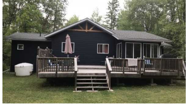
Stunning 4 Season Whiteshell Cottage for Sale Block 12 Falcon Lake - Rear View