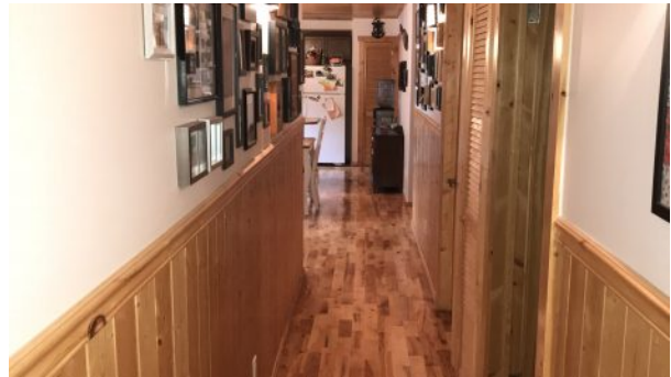
Stunning 4 Season Whiteshell Cottage for Sale Block 12 Falcon Lake - Hallway