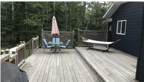
Stunning 4 Season Whiteshell Cottage for Sale Block 12 Falcon Lake - Rear Deck