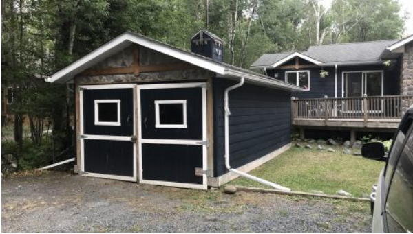
Stunning 4 Season Whiteshell Cottage for Sale Block 12 Falcon Lake - Garage