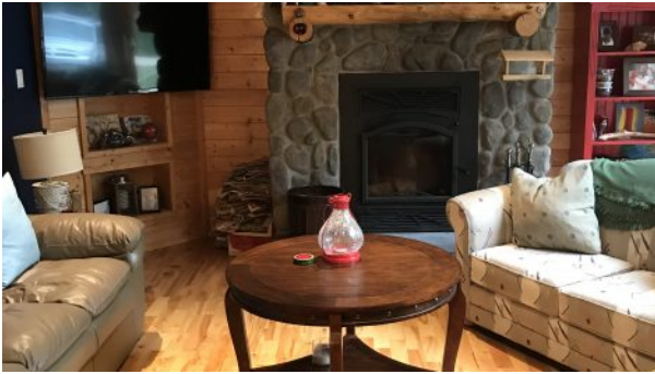
Stunning 4 Season Whiteshell Cottage for Sale Block 12 Falcon Lake - Fire Place