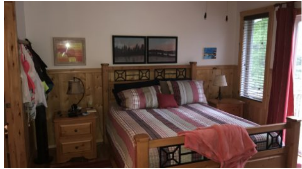
Stunning 4 Season Whiteshell Cottage for Sale Block 12 Falcon Lake - Master Bed Room