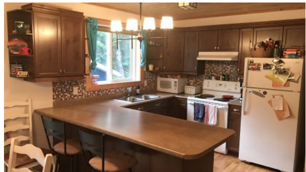
Stunning 4 Season Whiteshell Cottage for Sale Block 12 Falcon Lake - Kitchen