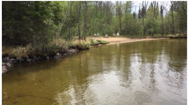
Falcon Lakefront Cottage for Sale