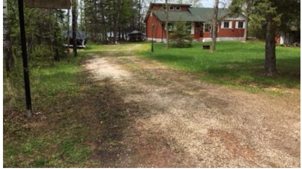
Falcon Lakefront Cottage for Sale