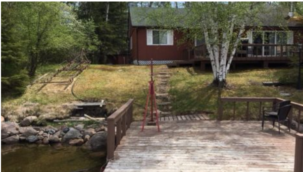
Falcon Lakefront Cottage for Sale