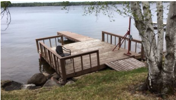
Falcon Lakefront Cottage for Sale