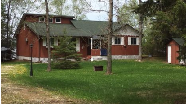
Falcon Lakefront Cottage for Sale